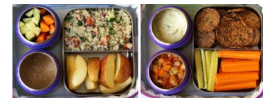
Healthy School Lunch Ideas